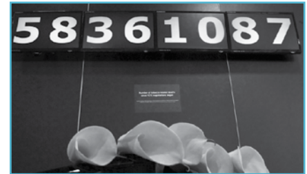
Death clock at the opening of INB1 (11 Feb. 2008), left, and INB5 (29 March 2012).